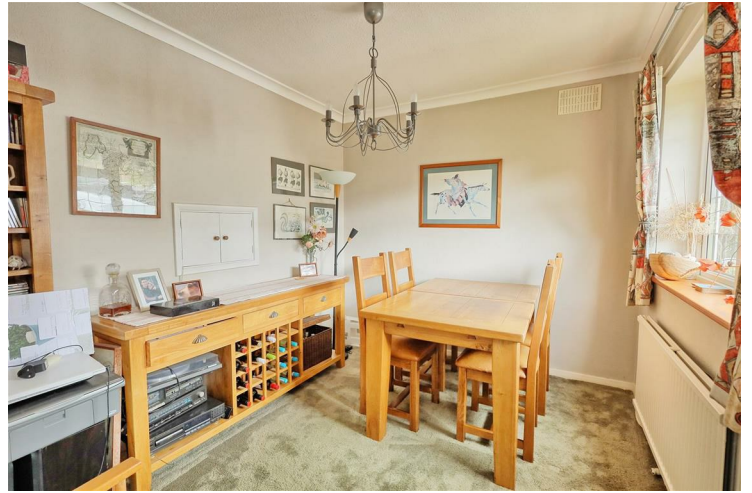
DINING ROOM 10'2" x 9'0" (3.1 x 2.76)