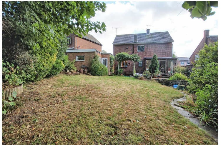
GARAGE 17'1" x 11'2" narr to 8'7" (5.22 x 3.41 narr to 2.62)