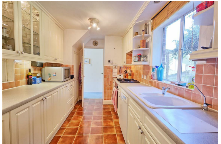
KITCHEN 11'7" x 8'0" (3.55 x 2.44)